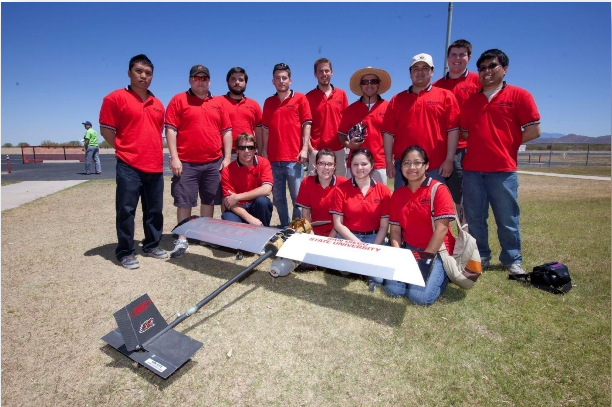
2008/2009 DBF Team and Competition Plane

First off, we would like to thank you for the interest in supporting the San Diego State University's Design, Build, Fly Team - DBF. This yearly international event is very important to us and we strive to make each year better. We rely on sources of support from private and corporate sponsors, like you, to help us grow and reach our goal of making the annual Design, Build, Fly Competition a top notch event and a great experience for all participating students. Your donation not only allows us to apply knowledge accumulated in the classroom to real world experiences, but also cultivates traits of teamwork, creativity, and determination in each of our students.